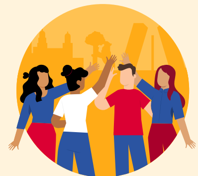
Settle in smoothly

Read more about the service by clicking here or book a free consultation and let's get started!