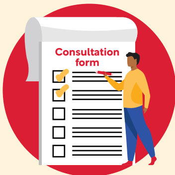
Fill out our consultation form