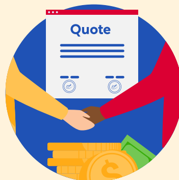
Get a free quote